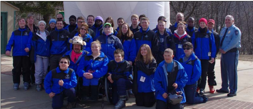
The St. Mary's County Delegation to the 2013 Winter Games poses just prior to the two days of competition.